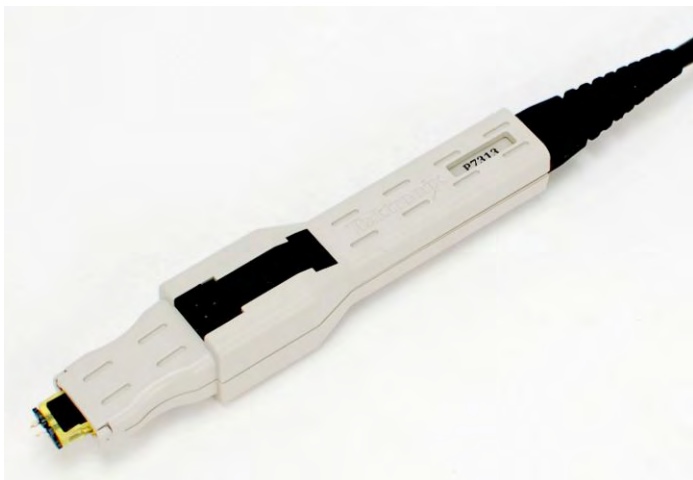
Handheld Adapter (HHA) accessory