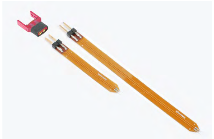
Quick Connect Flex Solder tips

The Quick Connect Flex Solder tips can bend in multiple axes allowing them to avoid obstacles on a circuit board, such as heat sinks, connectors, or tall components.